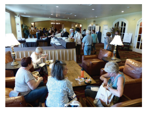
Lunch and a time to visit with friends.