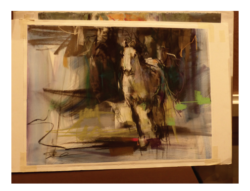
One of many paintings completed at Dawn Emerson's demonstration.