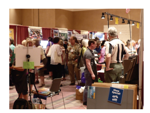
Excitement and inspiration on display, and for sale, at the Trade Show.