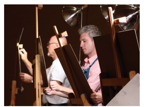
The Paint Around.