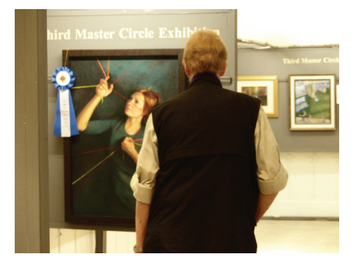
Viewing the PastelWorld Exhibition.