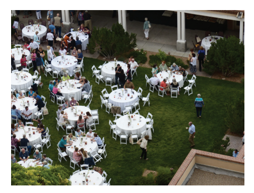
The Thursday Night Buffet and Gathering.