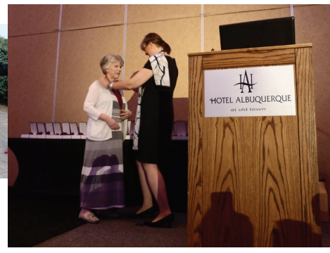
We presented 40 Masters Circle and three Eminent Pastelist awards.