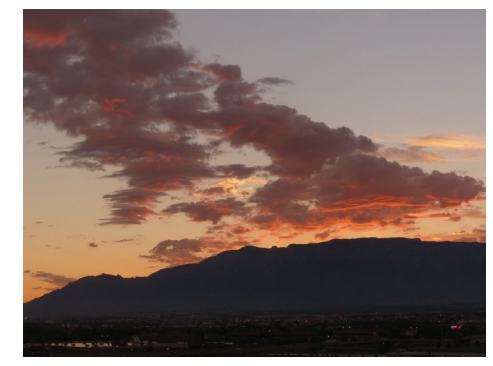
The Sangre de Cristo Mountains provided a magnificent setting....