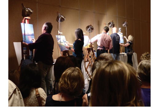
Always a crowd favorite - the Paint Around.