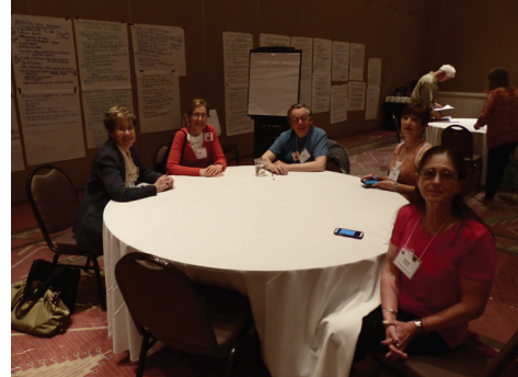
The Pastel Society of America table at the President's Forum.