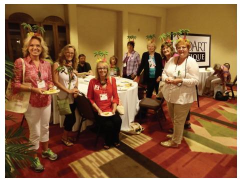
Fun for All.