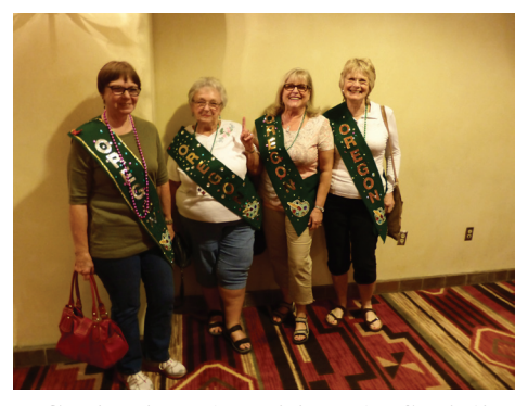
Getting into the spirit at the Social!