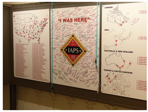
The "I WAS HERE" board was running out of room to sign.