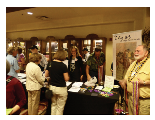
The Friday Night Social with the IAPS Member Societies.