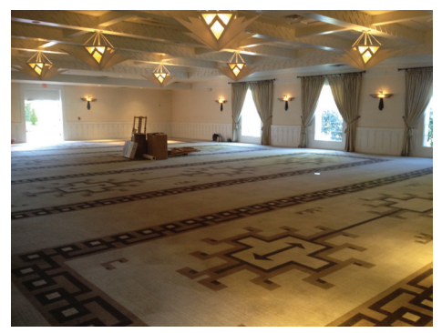
Ballroom before the exhibit is setup.