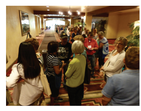
Lining up for the Trade Show opening.