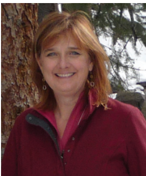
President, International Association of Pastel Societies